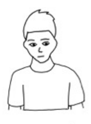
Sit or Stand